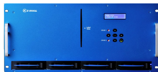
JUMBOX Blu-ray Archiving System